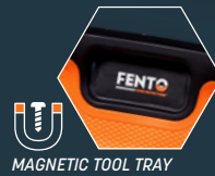
MAGNETIC TOOL TRAY