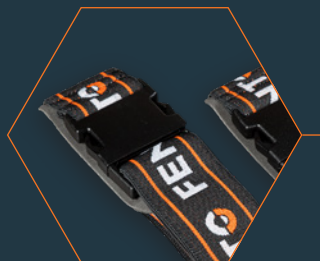
FENTO CLIP ELASTICS BDG # 28-0-202/ 28-0-402

Available for FENTO ORIGINAL and FENTO MAX.