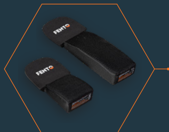
FENTO INLAYS BDG # 28-0-003/ 28-0-004

Extend the lifespan of your FENTO knee protector by replacing parts. Worn out the Inlays? Easily replace them for new ones. Change your Elastics or keep sand and dust out of your knee pads with Protective covers.